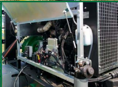
Motori Stage V nuova generazione Stage V engines new generation