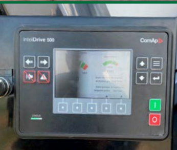
Centralina COMAP per gestione da remoto COMAP control box with remote management