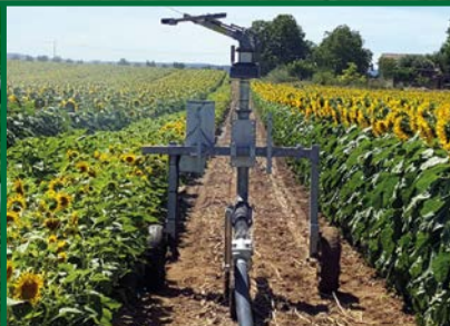
Controllo irrigatore TopRain Gun control TopRain