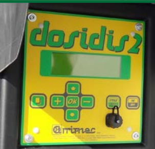
Dosidis 2 GSM