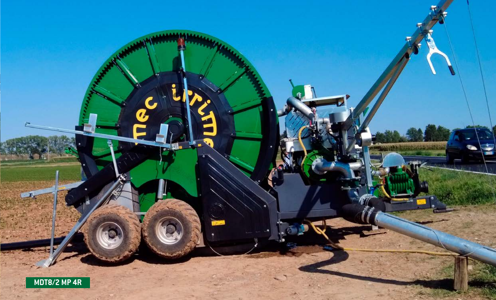
MDT8/2 MP 4R