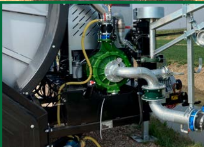
Kit aspirazione con ingresso supplementare Suction kit with additional inlet