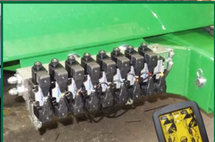
Radiocomando per movimentazione idraulica Remote control for hydraulic movements