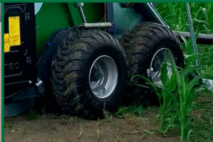
Ruote tallonate 400x15.5 Wheels 400x15.5 tractor profile