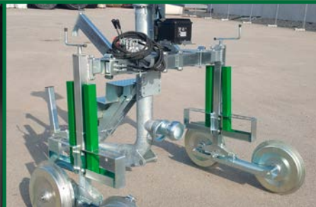
Carrello grossa portata a 4 ruote basculanti Trolley high flow guns with 4 pivot wheels